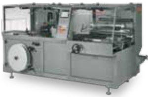
The figure may show optional equipment, ordered separately

The Universa 500 Servo is a hybrid that closes the gap between intermittent motion and continuous motion side sealers. It is the first time that a single machine can offer combined advantages from both machine types. Perfect packaging results for highest requirements. High impact retail packaging for books, magazines, chocolates, multimedia and industrial products and high value products.