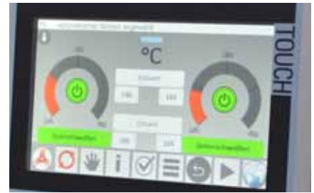
Universa 500 Servo: Perfect packaging results for highest requirements. With 7" widescreen Easy Touch-Panel.